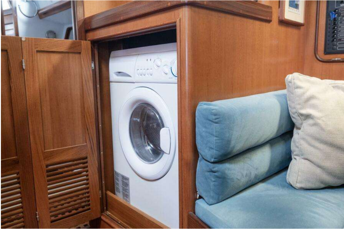
Passport Vista 515 For Sale008