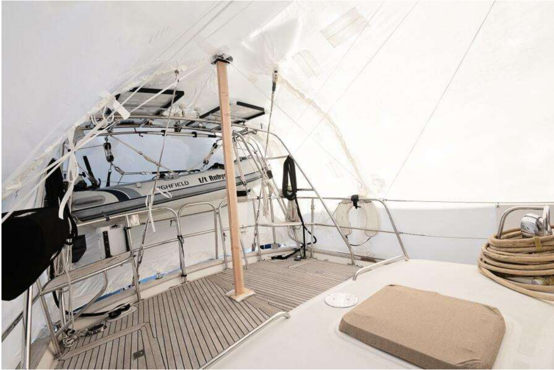
Passport Vista 515 For Sale017