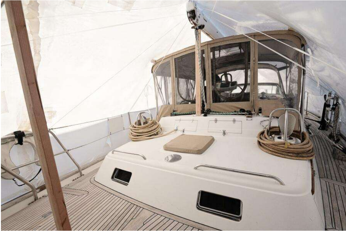
Passport Vista 515 For Sale019