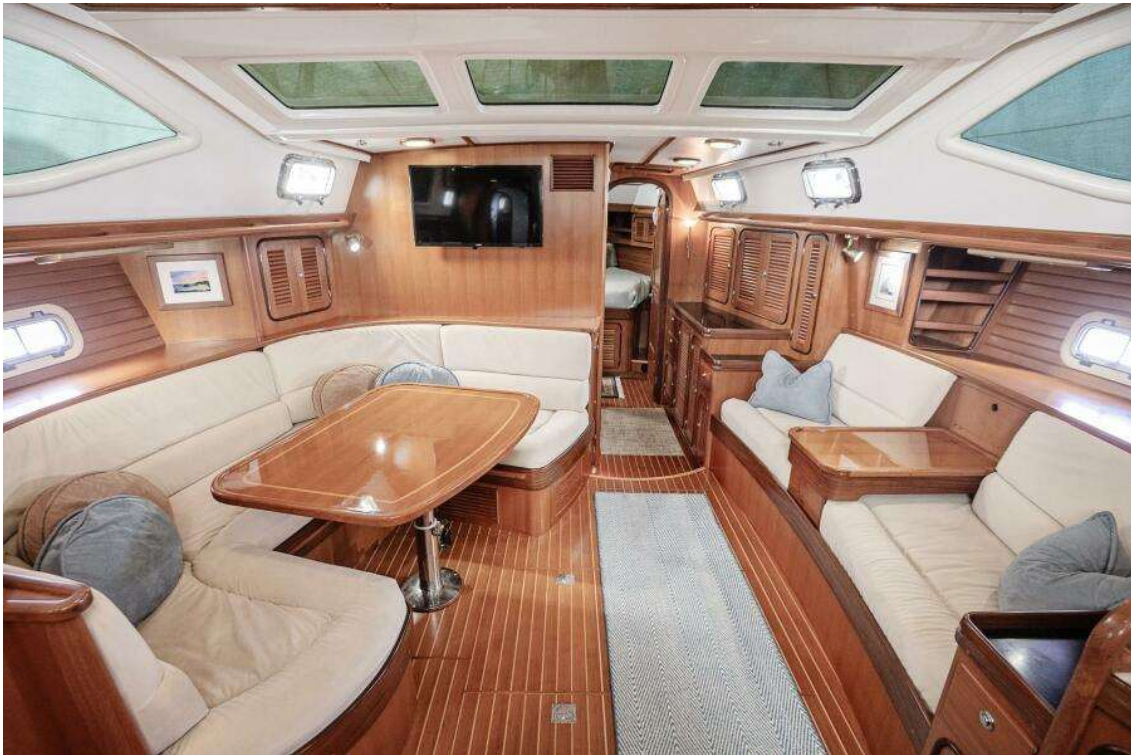
Passport Vista 515 For Sale001