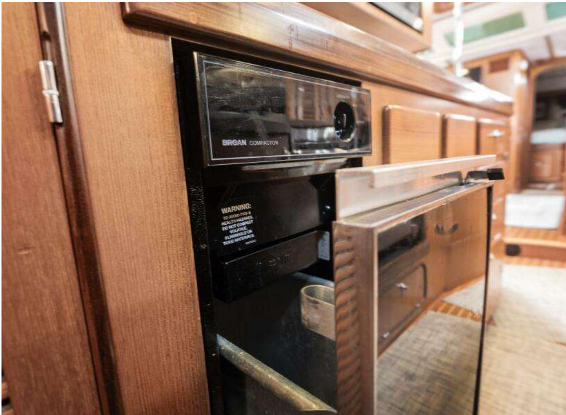
Passport Vista 515 For Sale004