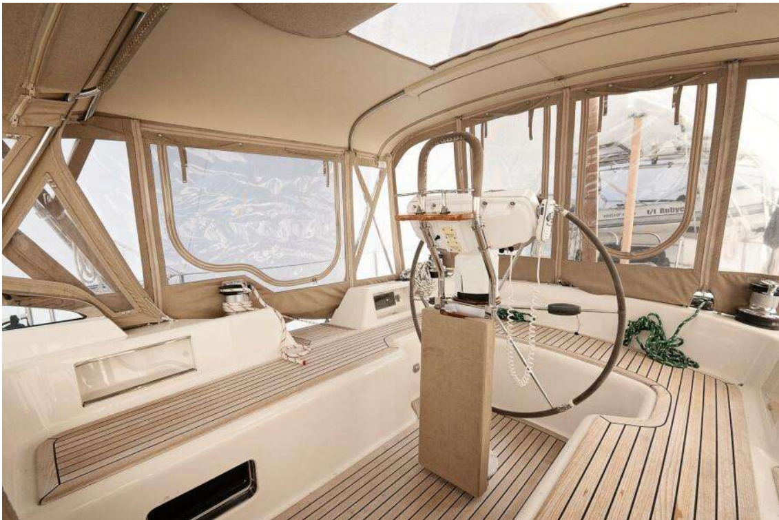
Passport Vista 515 For Sale020