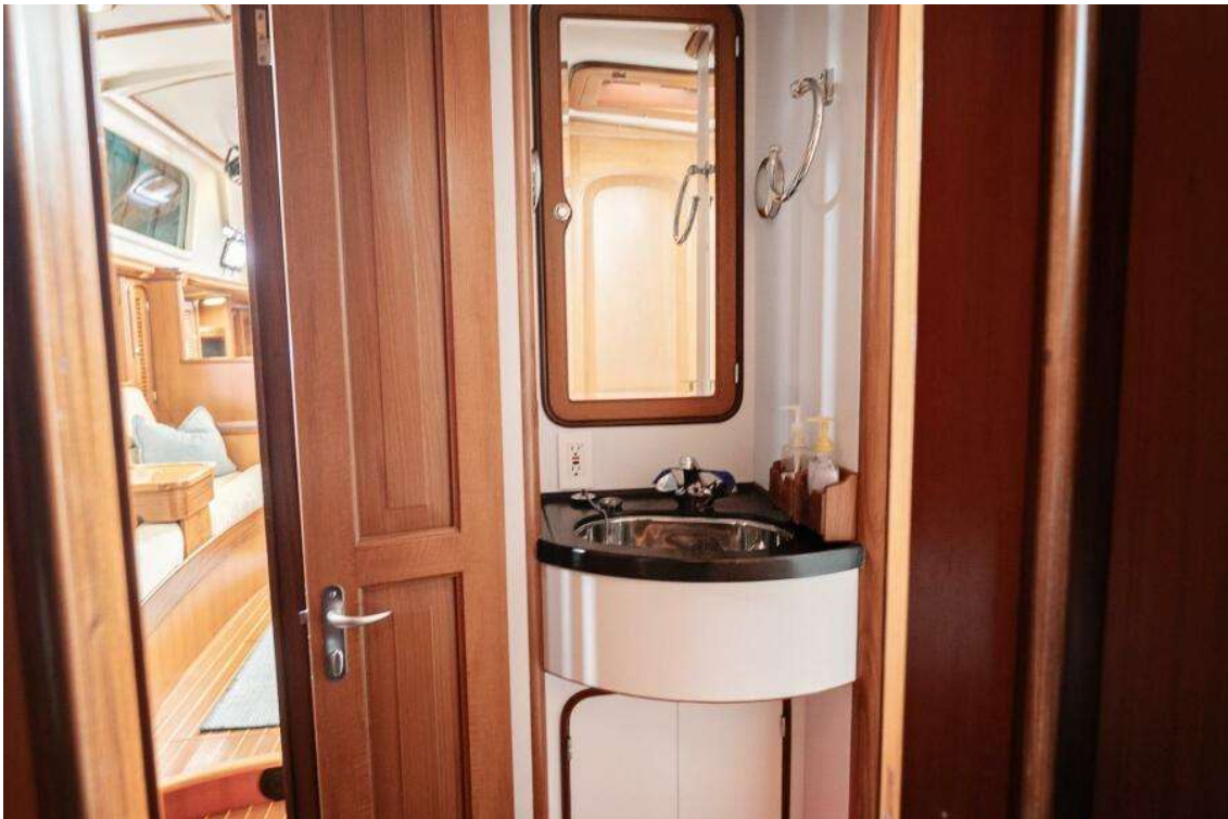
Passport Vista 515 For Sale011