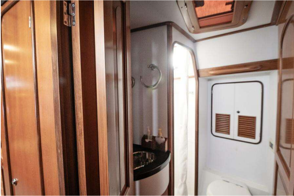
Passport Vista 515 For Sale012