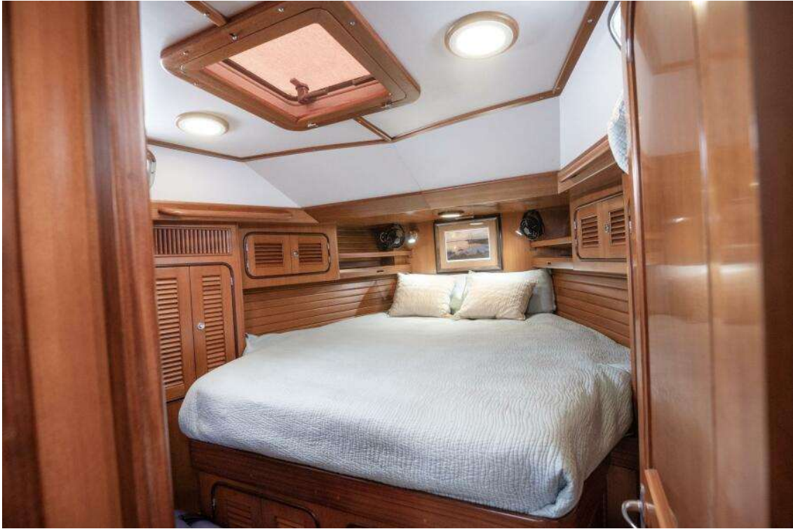
Passport Vista 515 For Sale010