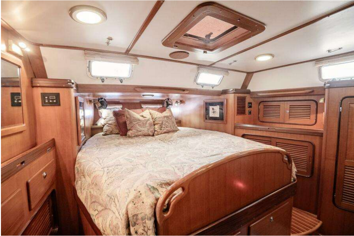
Passport Vista 515 For Sale005