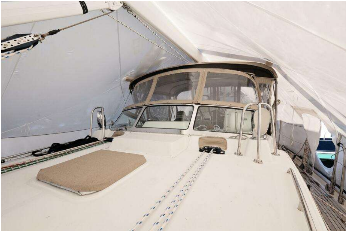
Passport Vista 515 For Sale016