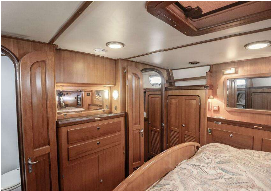
Passport Vista 515 For Sale006