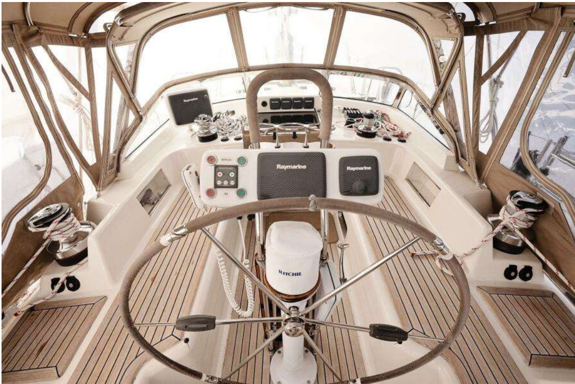
Passport Vista 515 For Sale021