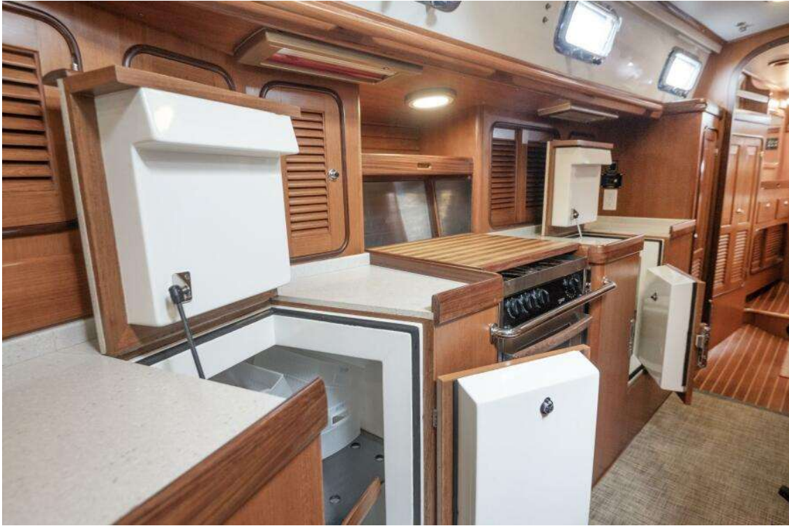
Passport Vista 515 For Sale003