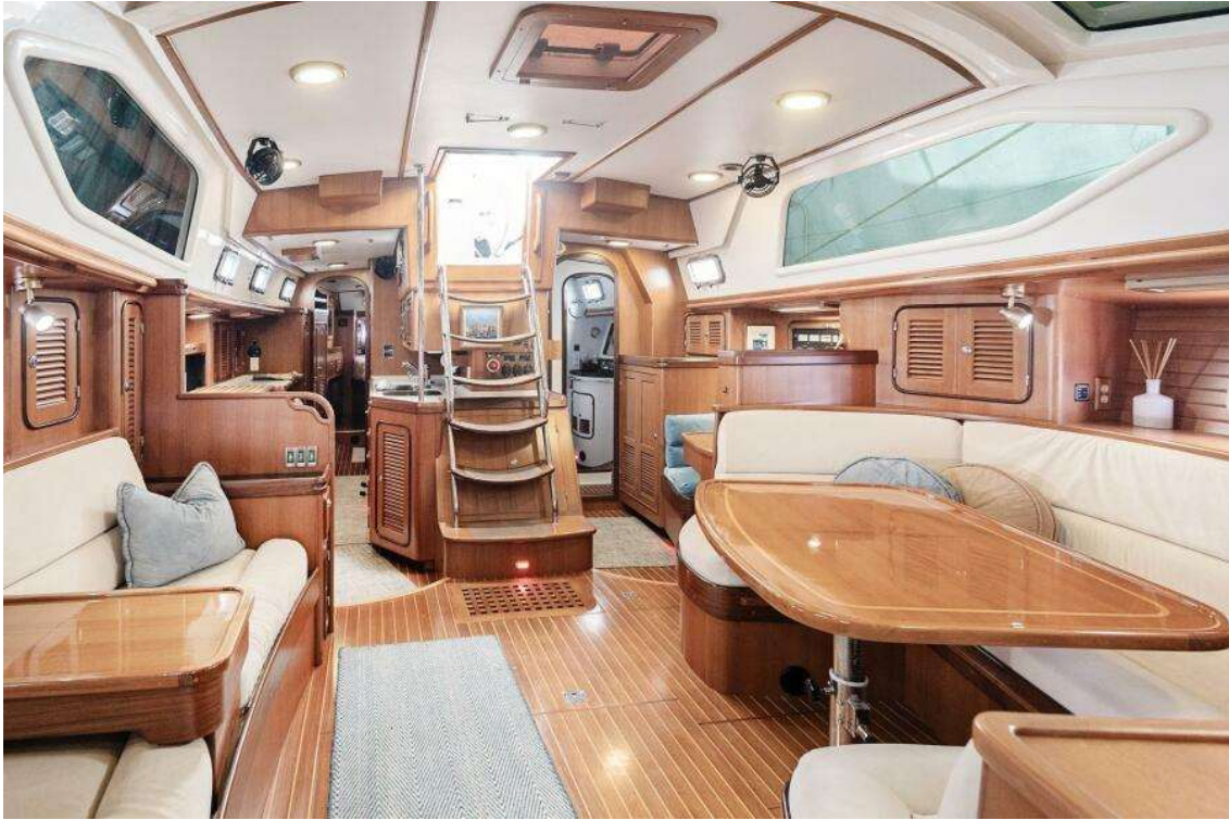
Passport Vista 515 For Sale014