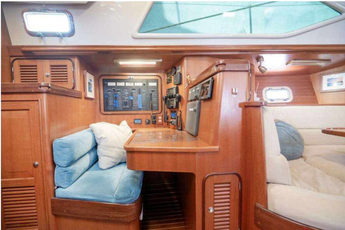
Passport Vista 515 For Sale009