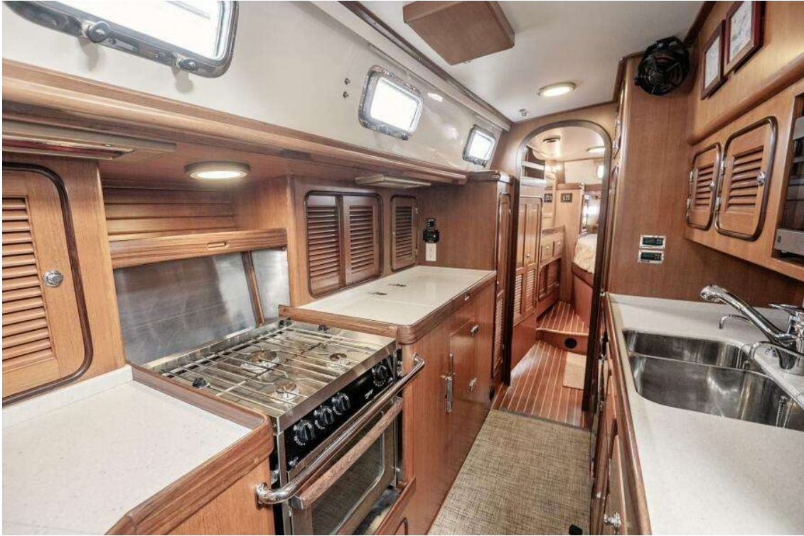
Passport Vista 515 For Sale002