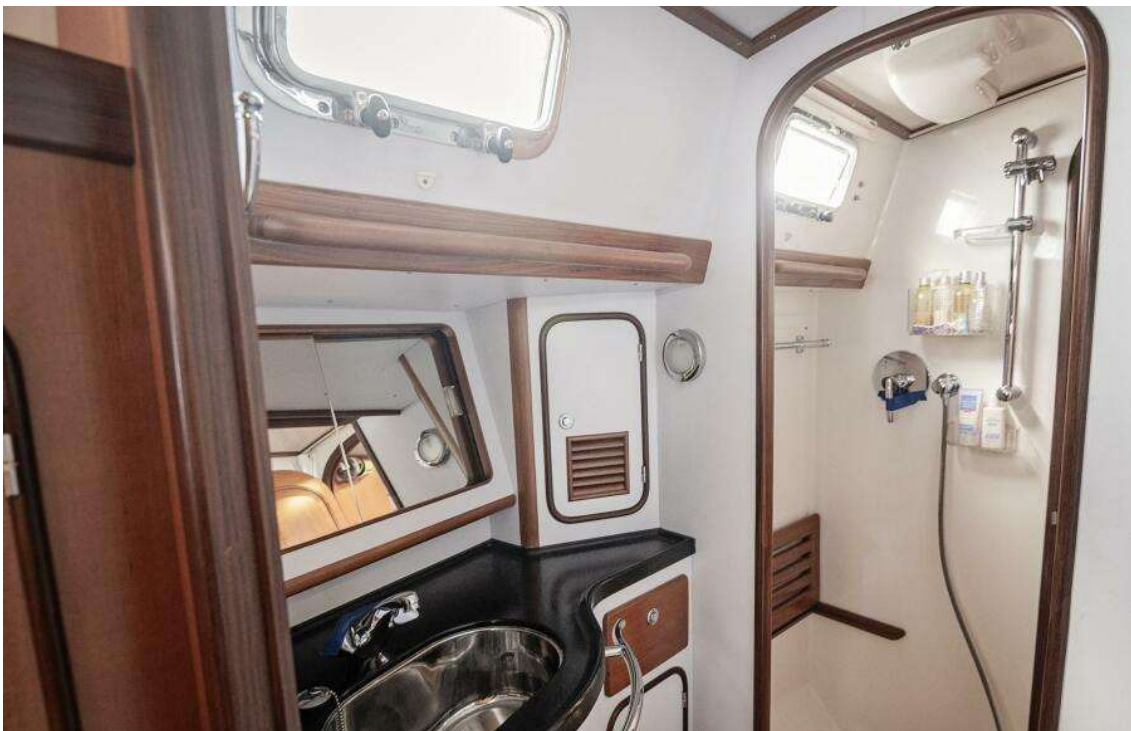
Passport Vista 515 For Sale007