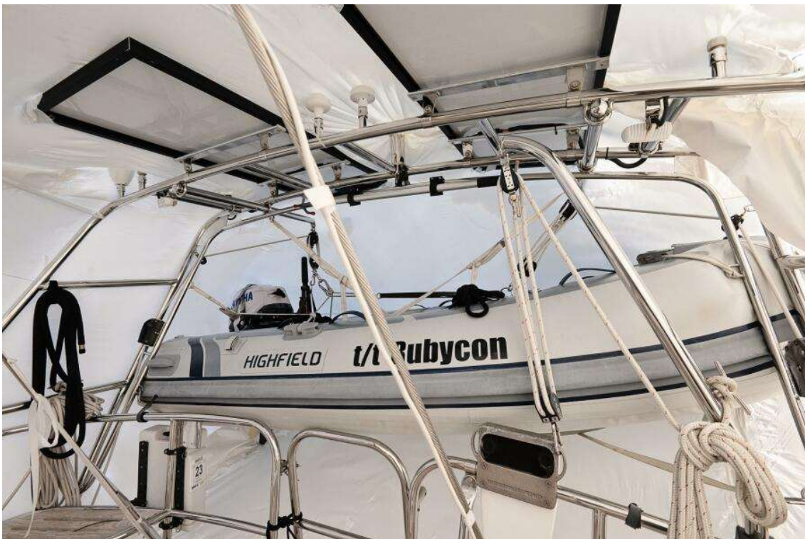
Passport Vista 515 For Sale018