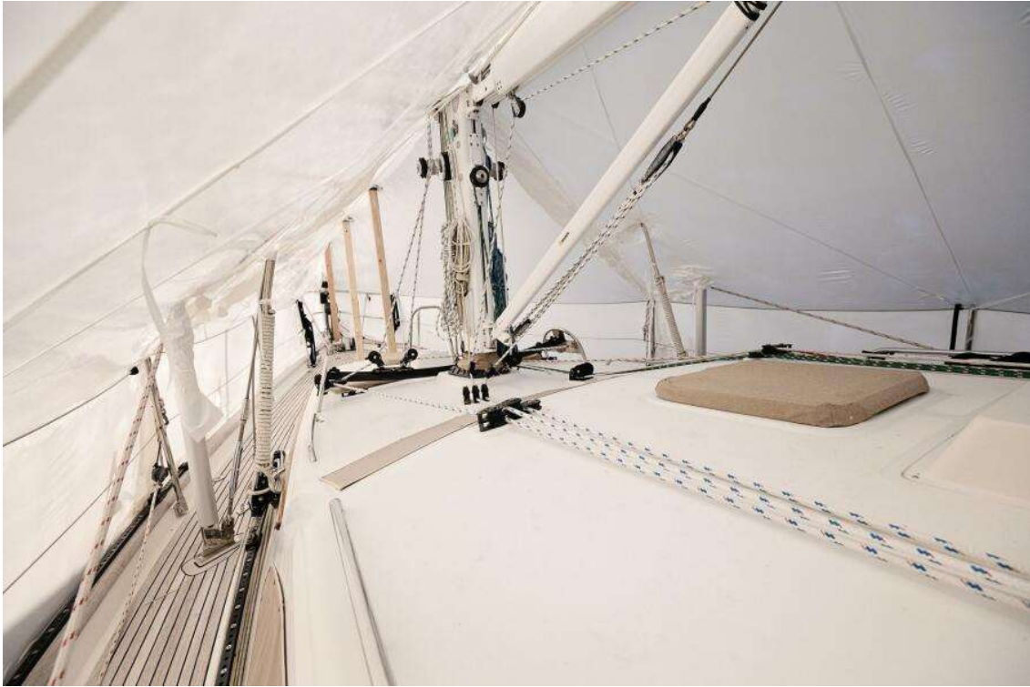
Passport Vista 515 For Sale015